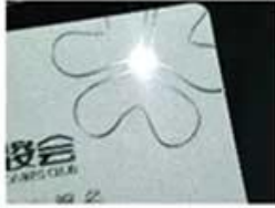
Silver Hot Stamping