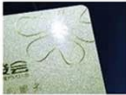
golden Hot Stamping