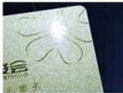
golden Hot Stamping