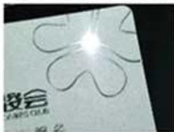
Silver Hot Stamping